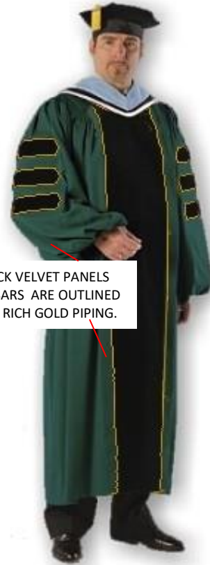
BLACK VELVET PANELS AND BARS ARE OUTLINED WITH RICH GOLD PIPING.

Authentic Plymouth State University regalia authorized by the Educational Leadership, Learning and Curriculum Department of the University.